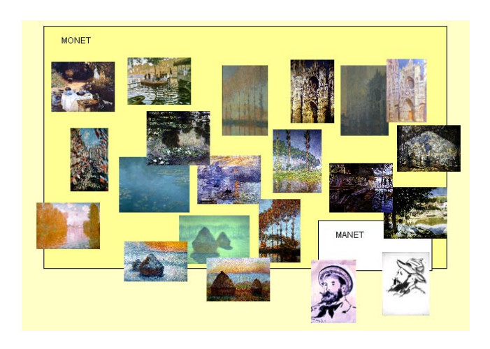
Figure 2: The MONET Cluster

DIDO: Another instantiation of the system enables users to browse search results from the Dido Image Bank, http://www.dlib.indiana.edu/collections/dido/ provided by the Department of the History of Art, Indiana University. Dido stores about 9,500 digitized images from the Fine Arts Slide Library collection of over 320,000 images. Each image in Dido is stored together with its thumbnail representation as well as a textual description. LSA was applied over the textual descriptions exclusively. For demonstration purposes the set of images matching the keyword descriptor 'MONET' were retrieved and displayed for browsing. It contains 21 documents inclusive two portraits of Claude Monet drawn by Edouard Manet (see Figure 2).