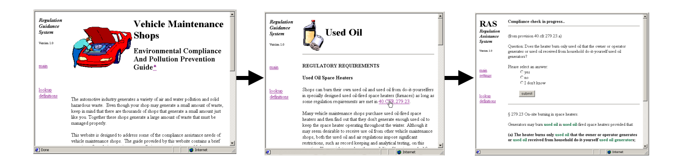
Figure 3. Linking industry-specific guides to the regulation assistance system